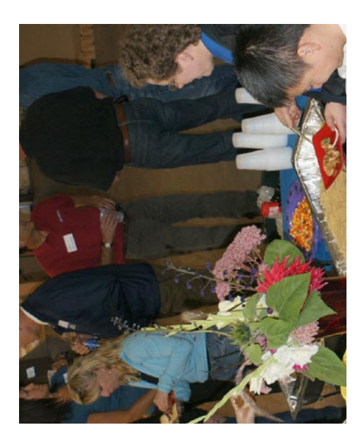
Central Heating & Cooling put on a spread