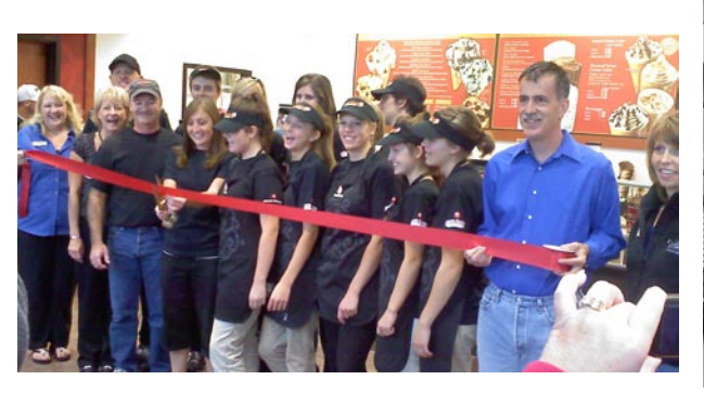
Stone Cold Creamery