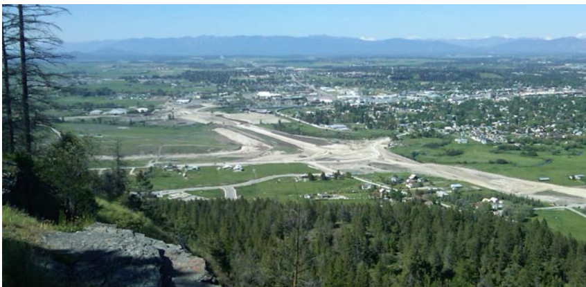
A view of progress on the Kalispell Alternative Route looking north from Lone Pine. Substantial completion on the project is scheduled for November.

The event will be held Thursday, July 29, from noon – 1:30 pm, at the Hilton Garden Inn Kalispell. The registration fee of $20 includes lunch. To reserve your seat, contact: Dee Durand, 888-442-MONT (6668) ext. 100. ●